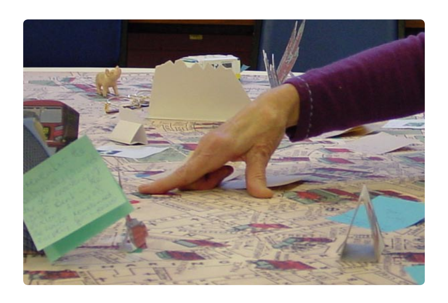
I remember the controversy caused by the erecting of Centre Point in the 60s. Many of the flats remained empty for years and it was thought to be the great White Elephant of its time.